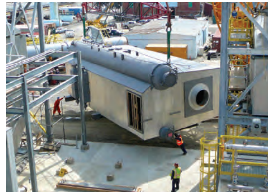
250,000 lb/hr 725 psig superheated boiler system.