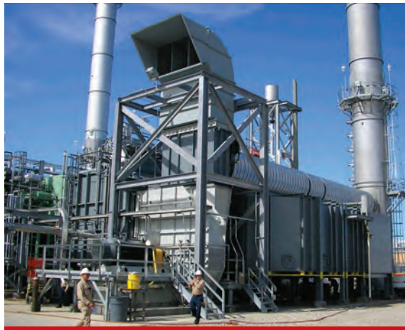
474,000 lb/hr 900 psig superheated boiler system.